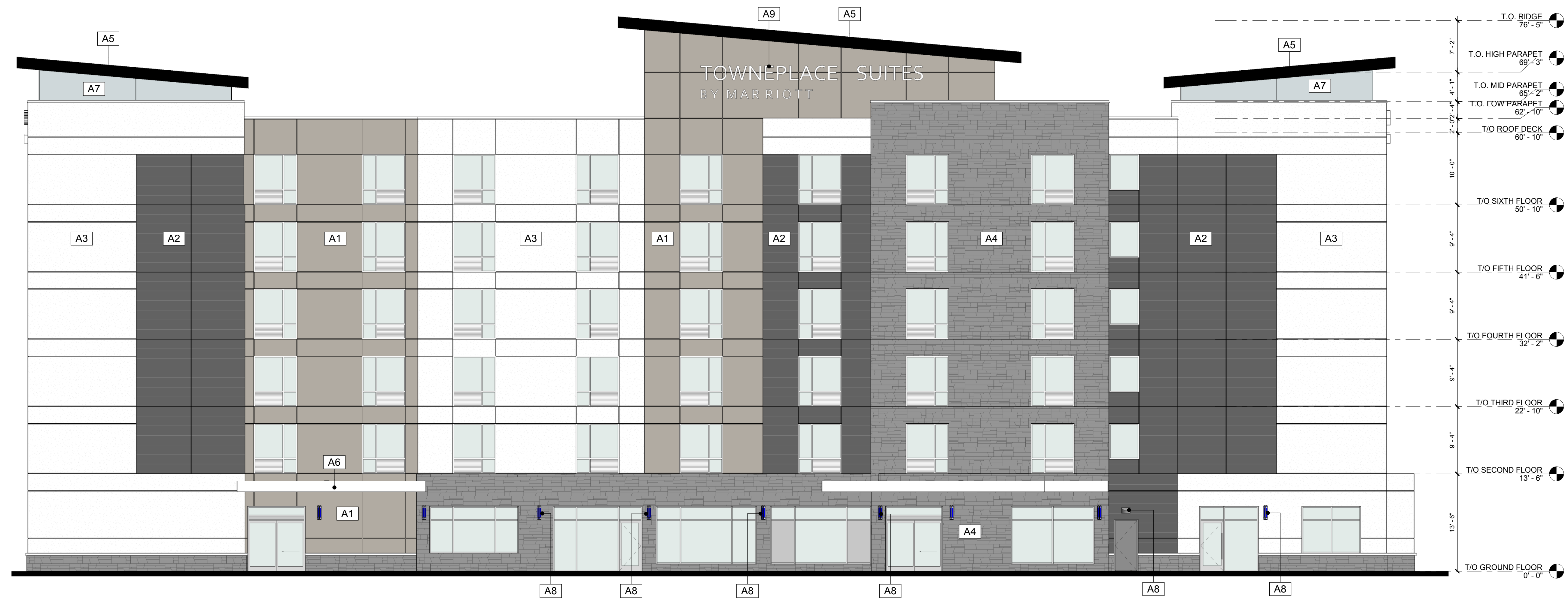
1 EAST ELEVATION A302 1/8" = 1'-0"