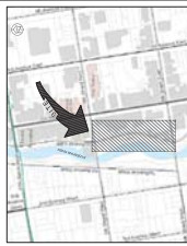
SITE KEY PLAN (1/8") OWEN SOUND, ON