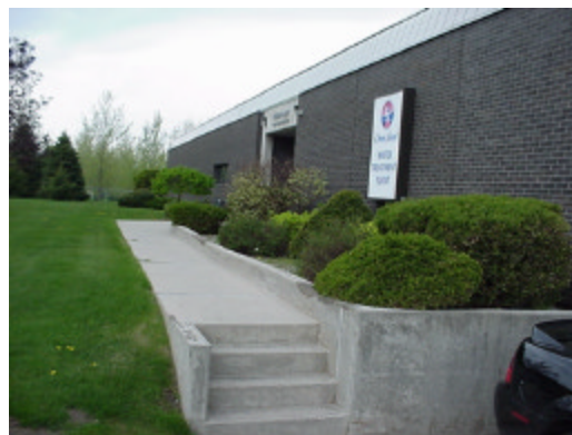
(Richard H. Neath Water Treatment Plant- front entrance)

XCG Consultants has completed their project on selecting the process requirements needed to meet CT requirement that are mandatory in the new Ontario Regulation 459/00 (O. Reg 459/00). From the options investigated, UV disinfection with clearwell baffling was the primary choice. Other items that were looked at were a backwash residue management system, and electrical upgrading needed to maximize plant efficiency. City Council has approved the above items and the project should begin early next year.