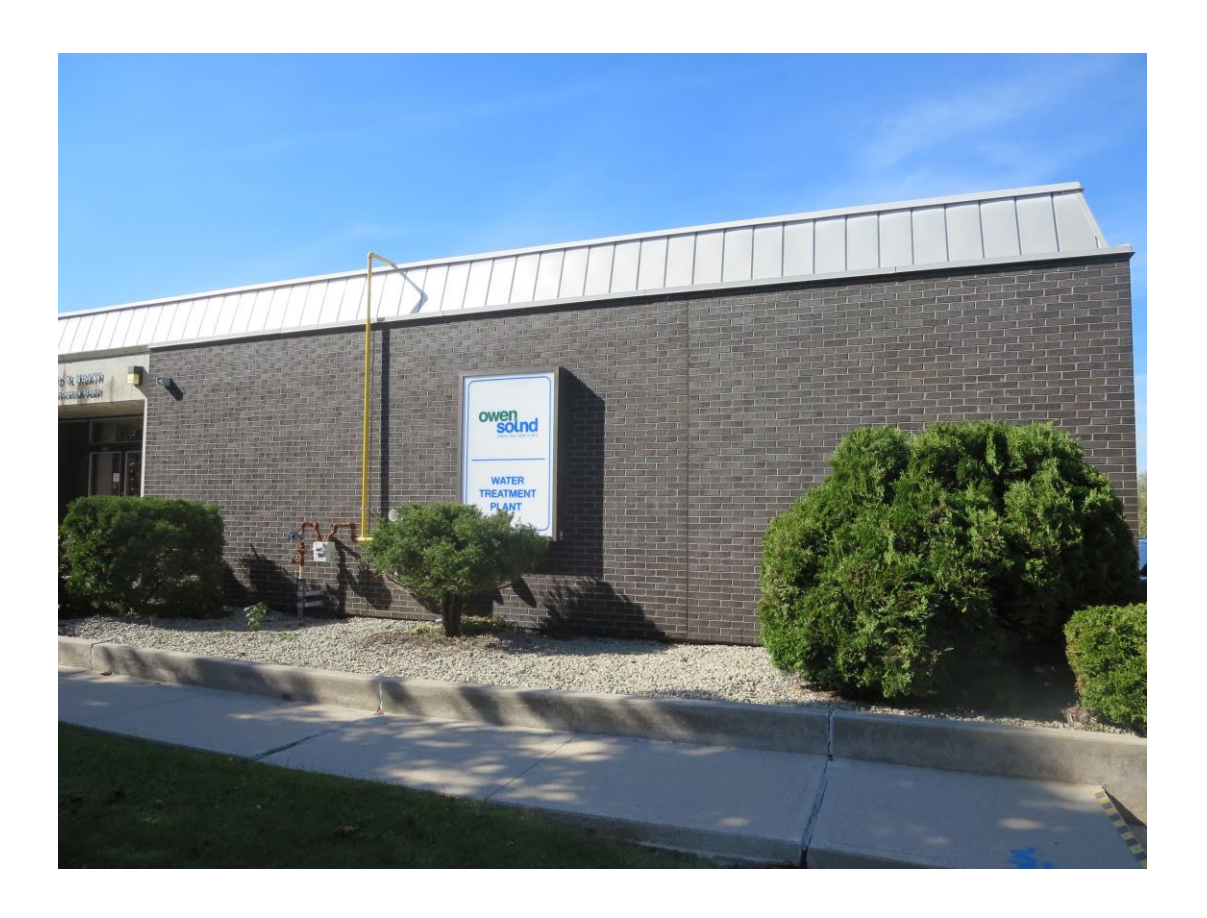
Annual Report 2022